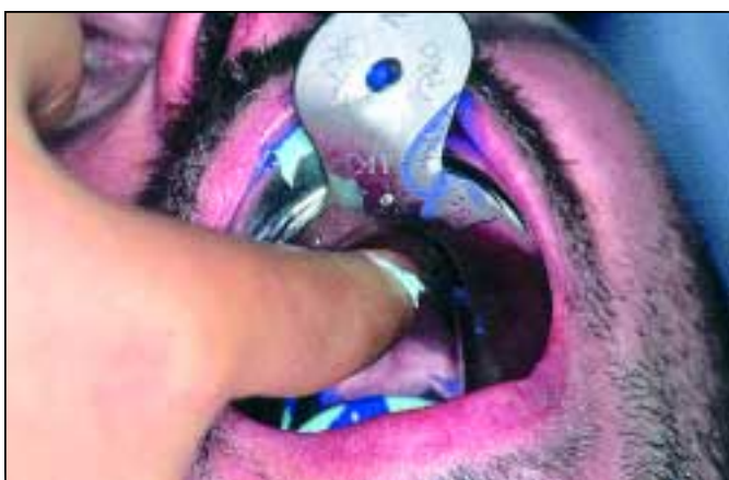
Figure 4: Inserting the tray

Adequate working time (approx. 1 min. 30 secs.) is available prior to inserting the impression tray into the patient's