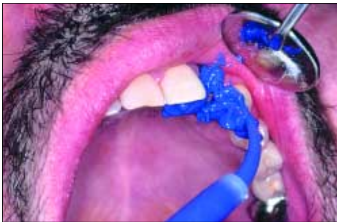
Figure 3: Syringing the impression material around the preparations

being impeded. Once the light bodied material has been applied in the patient's mouth, the loaded tray is also inserted into the mouth and gentle pressure applied for 3 - 4 seconds. While the material is setting fully, the tray should be held in position by the same person and without exerting pressure (Figure 4).