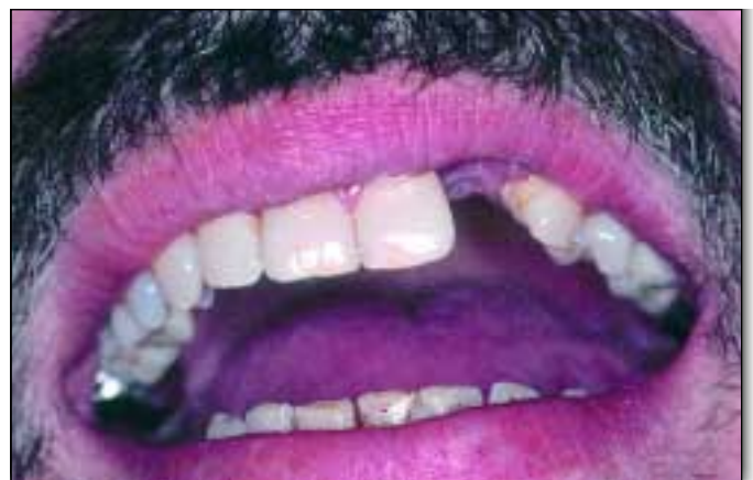
Figure 1: Preparations for a resin-bonded bridge on teeth 21-23

The new onetime perfect additioncuring silicone impression material was developed specifically for the one-step "sandwich" and putty-wash impression techniques. As this material only includes kneadable heavy bodied and light bodied materials, there is no need to select the materials from a large assortment, which would be time-consuming and complex. Once the correct tray has been selected and coated with adhesive, the heavy bodied material is kneaded by hand (mixing ratio - base paste : catalyst = 1:1) (Caution: Latex gloves may impede curing!), placed in the tray and a groove pressed into it to accommodate the teeth. The groove is then coated with light bodied material from a cartridge (Figures 1 and 2).